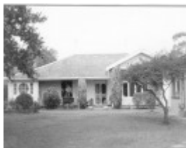
27057 Mt Pleasant Road No 79 Photo