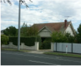
88 Mt Pleasant Road, Belmont