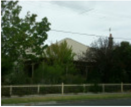
2 Peary Street, Belmont