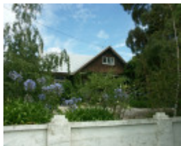
6 Peary Street, Belmont