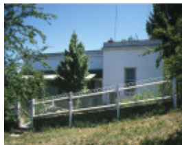
1 residence mostyn street castlemaine front view