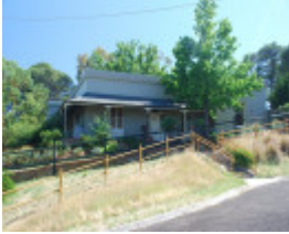
RESIDENCE SOHE 2008