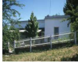
1 residence mostyn street castlemaine front view