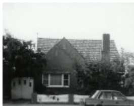
Dwelling, 26 Regent Street, Belmont, 1998