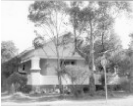
27105 Regent Street No 29 Photo