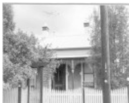
27115 Roslyn Road No 13 Photo