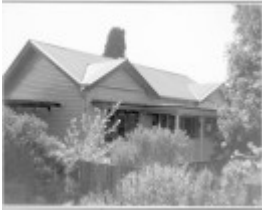
27131 Roslyn Road No 134 Photo