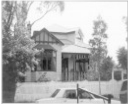
27185 Seaview Parade No 9 Photo