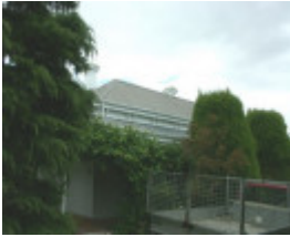
26 Spring Street, Belmont