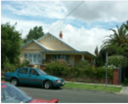
34 Thomson Street, Belmont