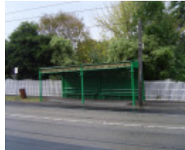
H0174 Tram shelter Balaclava Rd Front view Apr 2006