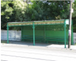
TRAM VERANDAH SHELTER SOHE 2008