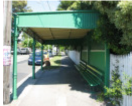
TRAM VERANDAH SHELTER SOHE 2008