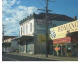
high626-8 - shops.jpg