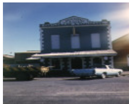
1 former shop & residence templeton street castlemaine front view