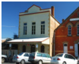
FORMER SHOP AND RESIDENCE SOHE 2008