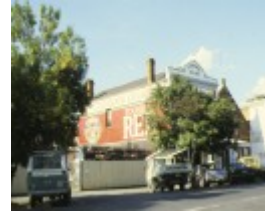
former shop & residence templeton street castlemaine side view