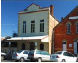
FORMER SHOP AND RESIDENCE SOHE 2008