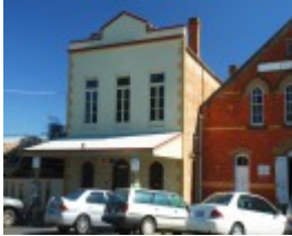
FORMER SHOP AND RESIDENCE SOHE 2008