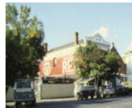
former shop & residence templeton street castlemaine side view