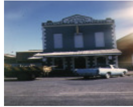
1 former shop & residence templeton street castlemaine front view