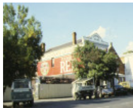
former shop & residence templeton street castlemaine side view