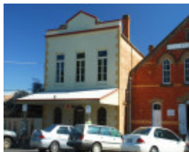
FORMER SHOP AND RESIDENCE SOHE 2008