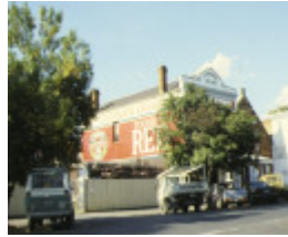
former shop & residence templeton street castlemaine side view