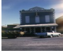
1 former shop & residence templeton street castlemaine front view