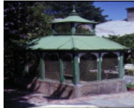
buda castlemaine aviary