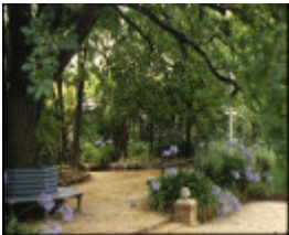
buda castlemaine gardens