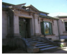
1 buda castlemaine entrance