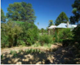
BUDA SOHE 2008