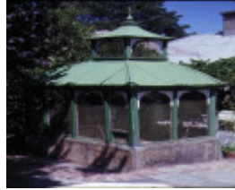
buda castlemaine aviary