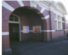
caulfield railway station normanby road caufield side detail jan1998