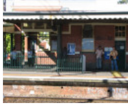
CAULFIELD RAILWAY STATION COMPLEX SOHE 2008