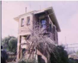
caulfield railway station normanby road caufield signal box aug1998