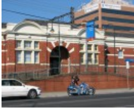
CAULFIELD RAILWAY STATION COMPLEX SOHE 2008