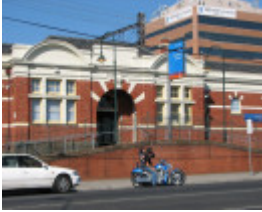
CAULFIELD RAILWAY STATION COMPLEX SOHE 2008