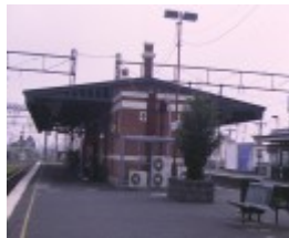
caulfield railway station normanby road caufield platform view aug1998