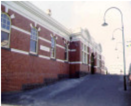
caulfield railway station normanby road caufield entry sw aug1998