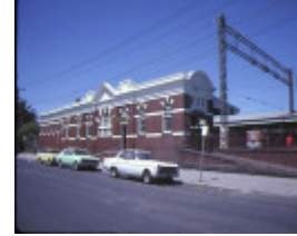
1 caulfield railway station normanby road caufield front view nov1984