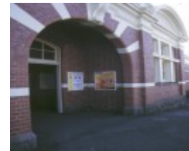
caulfield railway station normanby road caufield side detail jan1998