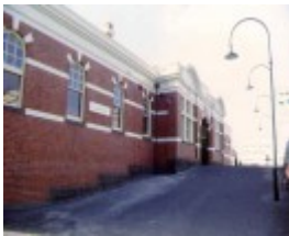
caulfield railway station normanby road caufield entry sw aug1998