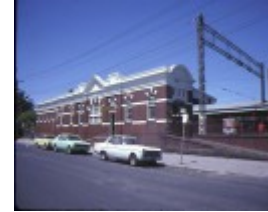
1 caulfield railway station normanby road caufield front view nov1984