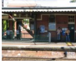
CAULFIELD RAILWAY STATION COMPLEX SOHE 2008