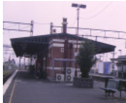
caulfield railway station normanby road caufield platform view aug1998