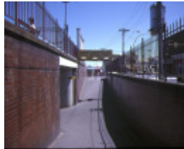
caulfield railway station normanby road caufield underpass nov1984