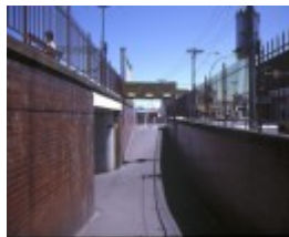
caulfield railway station normanby road caufield underpass nov1984