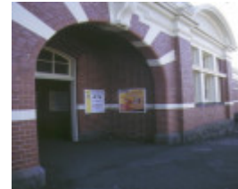
caulfield railway station normanby road caufield side detail jan1998