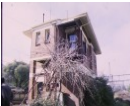
caulfield railway station normanby road caufield signal box aug1998