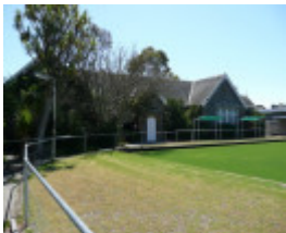
FORMER PROTESTANT ORPHAN ASYLUM AND COMMON SCHOOL SOHE 2008