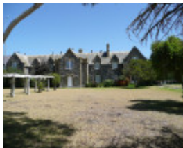
FORMER PROTESTANT ORPHAN ASYLUM AND COMMON SCHOOL SOHE 2008