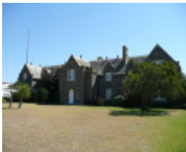
FORMER PROTESTANT ORPHAN ASYLUM AND COMMON SCHOOL SOHE 2008