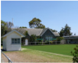
FORMER PROTESTANT ORPHAN ASYLUM AND COMMON SCHOOL SOHE 2008