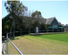
FORMER PROTESTANT ORPHAN ASYLUM AND COMMON SCHOOL SOHE 2008