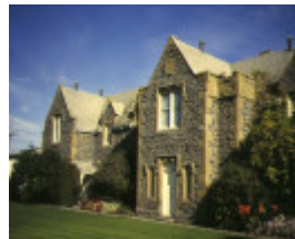
1 former protestant orphan asylum & common school herne hill front view of asylum