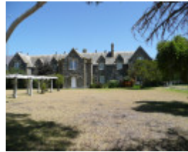
FORMER PROTESTANT ORPHAN ASYLUM AND COMMON SCHOOL SOHE 2008