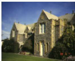
1 former protestant orphan asylum & common school herne hill front view of asylum