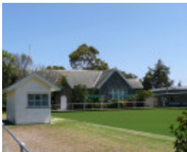
FORMER PROTESTANT ORPHAN ASYLUM AND COMMON SCHOOL SOHE 2008