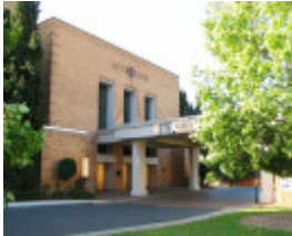
HEIDELBERG TOWN HALL SOHE 2008