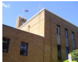
h02077 heidelberg town hall dec 2004