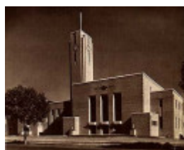
h02077 heidelberg town hall 1937