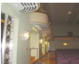
h02077 heidelberg town hall balconies dec 2004