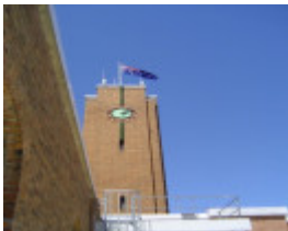
Heidelberg Town Hall Clocktower December 2004