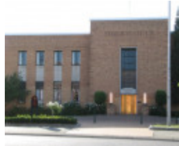
HEIDELBERG TOWN HALL SOHE 2008