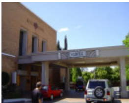
h02077 heidelberg town hall port cochere dec 2004