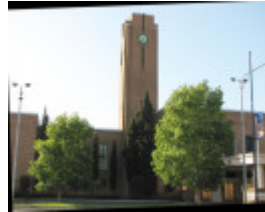
HEIDELBERG TOWN HALL SOHE 2008