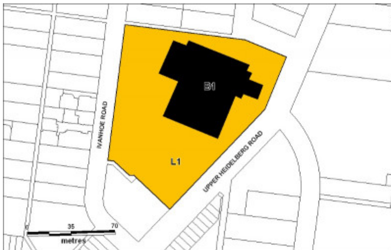
Heidelberg Town Hall Extent December 2005