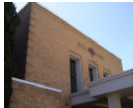
h02077 heidelberg town hall facade north dec 2004