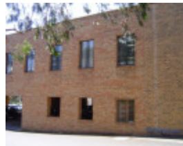
h02077 heidelberg town hall south west addition dec 2004