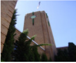
Heidelberg Town Hall Clocktower December 2004