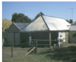
neuchatel merrawarp road ceres stables