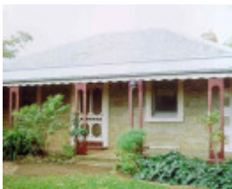
neuchatel merrawarp road ceres verandah view publication