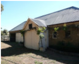
NEUCHATEL SOHE 2008