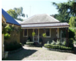
NEUCHATEL SOHE 2008