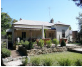
NEUCHATEL SOHE 2008