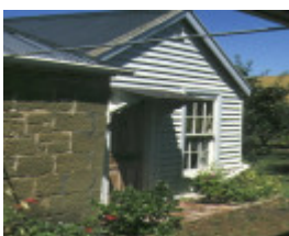
neuchatel merrawarp road ceres workingmen's room