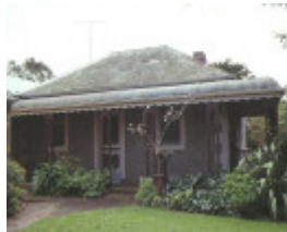
1 neuchatel merrawarp road ceres front view homestead