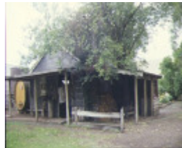
neuchatel merrawarp road ceres outbuilding winery