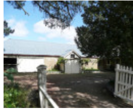
NEUCHATEL SOHE 2008