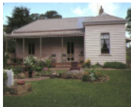
neuchatel merrawarp road ceres weatherboard house