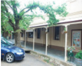
FORMER ROYAL HOTEL AND THEATRE SOHE 2008