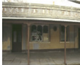
1 former royal hotel & theatre high street maldon front entrance sep1997