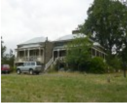
SKELSMERGH HALL SOHE 2008