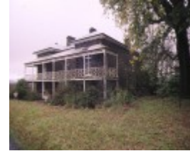
Montpellier Flour Mill House Calder Hwy Carlsruhe Front View