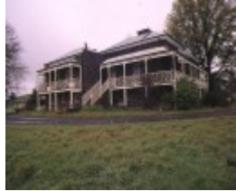
1 montpellier flour mill house calder hwy carlsruhe side view