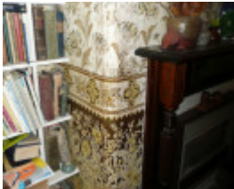
PASTORIA HOMESTEAD SOHE 2008