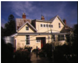
h01179 pastoria homestead kyneton baynton road pipers creek rear view