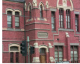
28247 Francis St Former Yarraville Primary School