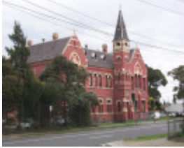
28247 Francis St Former Yarraville Primary School