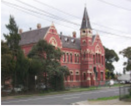
28247 Francis St Former Yarraville Primary School