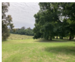
2023 avenue of elms RHS western end near the residence looking across the southern paddock