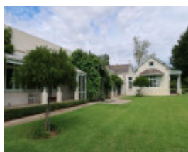
2022 view of north-east of Coombe Cottage looking west