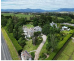
2023 Coombe Cottage