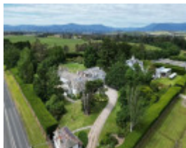
2023 Coombe Cottage