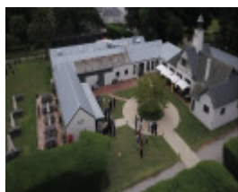
2015 stable yard with stables at centre with slate roof motor house with bell tower and 2015 additions