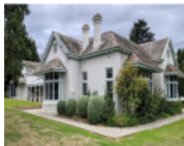
2022 view from southwest