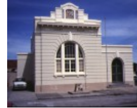
1 chelsea court house the strand chelsea front view