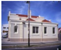
chelsea court house the strand chelsea side view