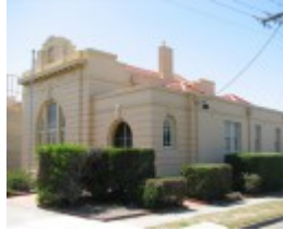
CHELSEA COURT HOUSE SOHE 2008