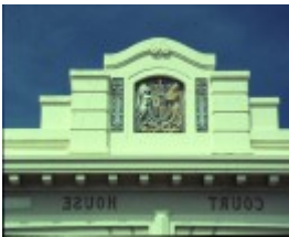
chelsea court house the strand chelsea detail of coat of arms