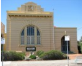
CHELSEA COURT HOUSE SOHE 2008