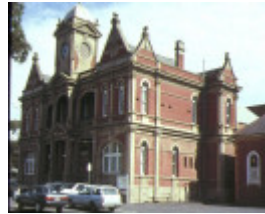
1 eaglehawk town hall mechanics institute & two hmvs nelson cannons eaglehawk side view