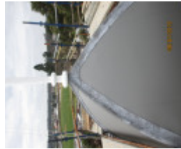
After Photographs - Reference F3844 08/07/15