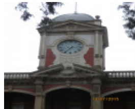
After Photographs - Reference F3844 13/07/15