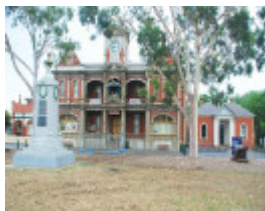
EAGLEHAWK TOWN HALL, MECHANICS INSTITUTE AND TWO HMVS NELSON CANNONS SOHE 2008