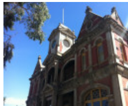
Before Photograph - Reference F3844 2014