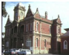
1 eaglehawk town hall mechanics institute & two hmvs nelson cannons eaglehawk side view