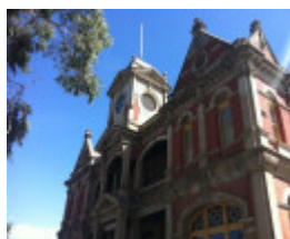
Before Photograph - Reference F3844 2014