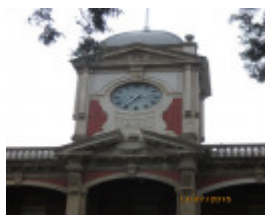
After Photographs - Reference F3844 13/07/15