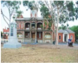
EAGLEHAWK TOWN HALL, MECHANICS INSTITUTE AND TWO HMVS NELSON CANNONS SOHE 2008