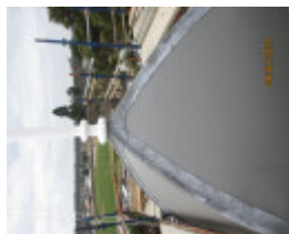
After Photographs - Reference F3844 08/07/15