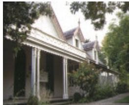
1 barwon grange fernleigh street newtown front view apr1997