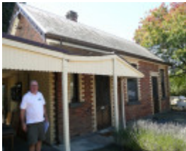
BARWON GRANGE SOHE 2008