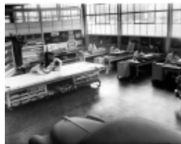
GMH Fishermans Bend - Plant 3 Interior - 1950