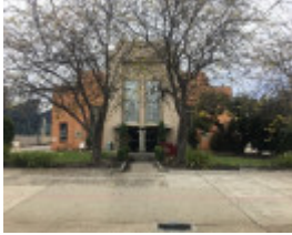
GMH - Social Centre - 2019