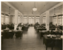
GMH Fishermans Bend - Administration Building Interior - c 1938