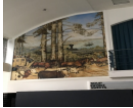
GMH Fishermans Bend mural 1a