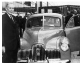
GMH Fishermans Bend - Prime Minister Ben Chifley at launch of Holden 48-215 at Fishermans Bend - 1948