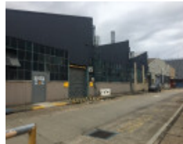
GMH Fishermans Bend - Plant 3 western elevation - 2019