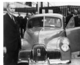
GMH Fishermans Bend - Prime Minister Ben Chifley at launch of Holden 48-215 at Fishermans Bend - 1948