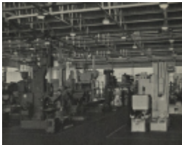
GMH Fishermans Bend - Plant 3 interior - 1945