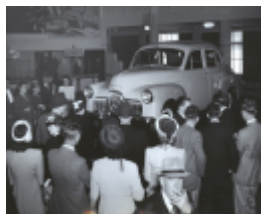
GMH Fishermans Bend - Social Centre during launch of Holden 48-215 - 1948