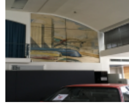
GMH Fishermans Bend - mural 2a