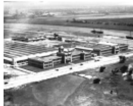
GMH Fishermans Bend - c 1938