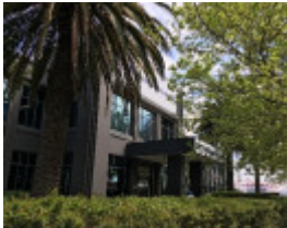
GMH Fishermans Bend - Parts Building - 2019