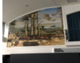
GMH Fishermans Bend mural 1a