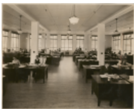
GMH Fishermans Bend - Administration Building Interior - c 1938