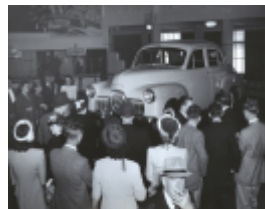
GMH Fishermans Bend - Social Centre during launch of Holden 48-215 - 1948