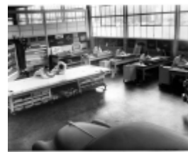
GMH Fishermans Bend - Plant 3 Interior - 1950