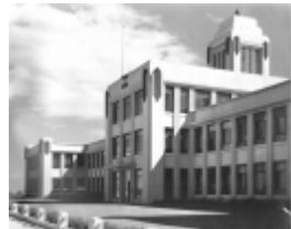
GMH Fishermans Bend - c 1938