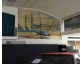
GMH Fishermans Bend - mural 2a