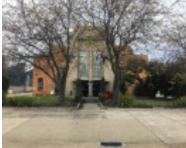
GMH - Social Centre - 2019