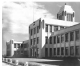
GMH Fishermans Bend - c 1938