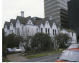
1 former bendigonia queens road south melbourne front corner view