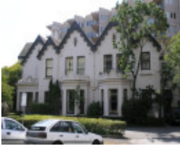
FORMER BENDIGONIA SOHE 2008