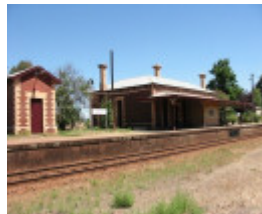
Chiltern railway station Building B1 & Lamp Room B2 February 2002