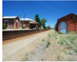
CHILTERN RAILWAY STATION AND GOODS SHED SOHE 2008