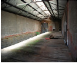
CHILTERN RAILWAY STATION AND GOODS SHED SOHE 2008