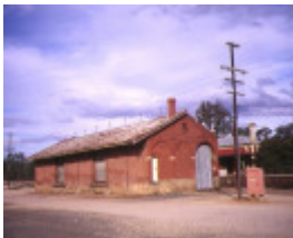
chiltern railway station & goods shed railway avenue chiltern goods shed apr1995