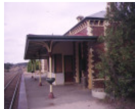
chiltern railway station & goods shed railway avenue chiltern platform verandah apr1995