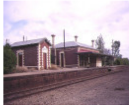
1 chiltern railway station & goods shed railway avenue chiltern trackside view apr1995