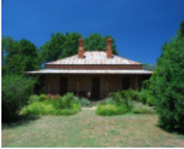
LAKE VIEW SOHE 2008