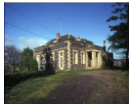
Barwon Park Riversdale Rd Marnock Vale Newtown Front View Sep 1977