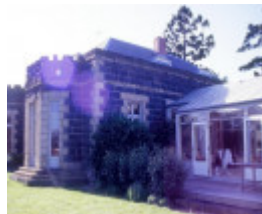
barwon bank riversdale road marnock vale newtown south east cnr she project 2004