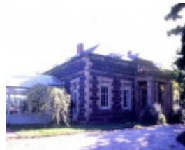
barwon bank riversdale road marnock vale newtown north east cnr she project 2004