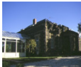
Barwon Bank Riversdale Rd Marnock Vale Newtown Additions 1997