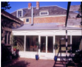
barwon bank riversdale road marnock vale newtown sunroom she project 2004