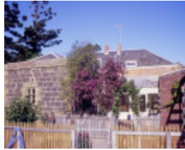
barwon bank riversdale road marnock vale newtown west elevations she project 2004