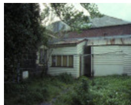
Barwon Bank Riversdale Rd Marnock Vale Newtown Kitchen Wing Sep 1977