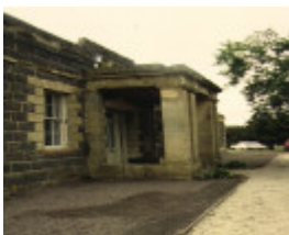
Barwon Bank Riversdale Rd Marnock Vale Newtown Front Entrance Sep 1977