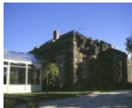
Barwon Bank Riversdale Rd Marnock Vale Newtown Additions 1997