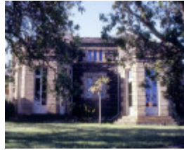
barwon bank riversdale road marnock vale newtown bay windows she project 2004