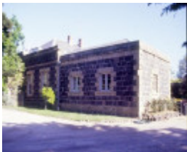
barwon bank riversdale road marnock vale newtown kitchen wing she project 2004