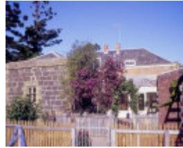
barwon bank riversdale road marnock vale newtown west elevations she project 2004