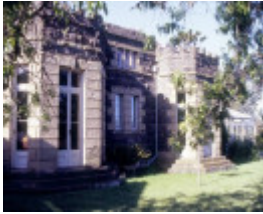
h00425 1 barwon bank riversdale road marnock vale newtown south west cnr she project 2004