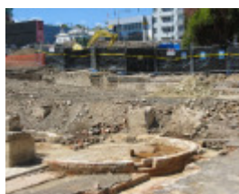
CUB March 2013 003.JPG