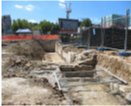
CUB March 2013 023.JPG