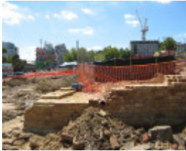
CUB March 2013 025.JPG