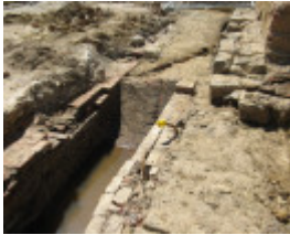
CUB March 2013 024.JPG