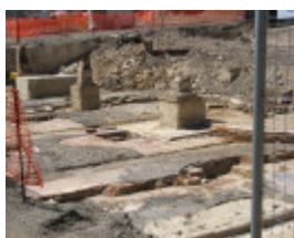
CUB March 2013 002.JPG