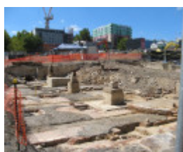
CUB 2013 (11).JPG