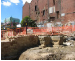
CUB March 2013 026.JPG