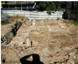
terrace houses at 170 Victoria Street, Carlton (CUB site)