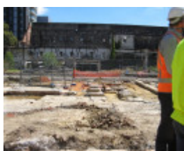
CUB 2013 (9).JPG