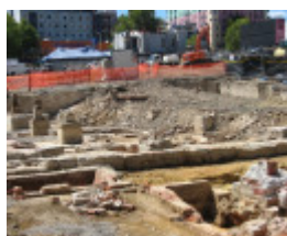
CUB March 2013 004.JPG