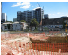
CUB 2013 (6).JPG