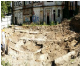
terrace houses at 170 Victoria Street, Carlton (CUB site)