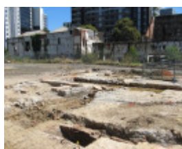
CUB 2013 (10).JPG