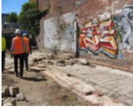
CUB March 2013 027.JPG