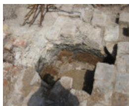
CUB 2013 (5).JPG