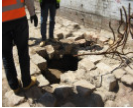
CUB March 2013 028.JPG