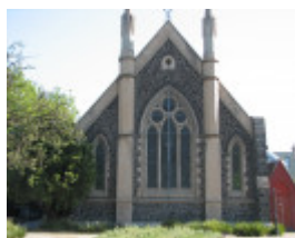
FORMER INDEPENDENT CHURCH SOHE 2008