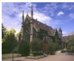
1 former independent church malvern road armadale west elevation feb1994