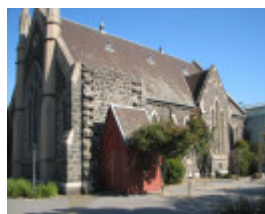
FORMER INDEPENDENT CHURCH SOHE 2008