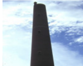
1 shot tower alexandra parade clifton hill tower view