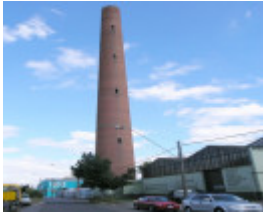
SHOT TOWER SOHE 2008