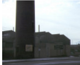
shot tower alexandra parade clifton hill front view