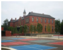
PRIMARY SCHOOL NO. 1360 SOHE 2008