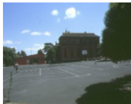
1 primary school number 1360 gold street clifton hill view of yard