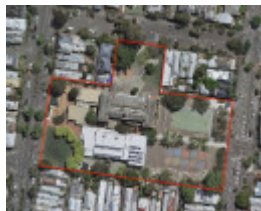
aerial extent of registration