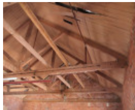
H1072 ECHUCA FLOUR MILL LHA 2015 6.JPG