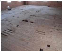
H1072 ECHUCA FLOUR MILL LHA 2015 8.JPG