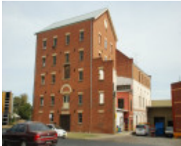
ECHUCA FLOUR MILL SOHE 2008