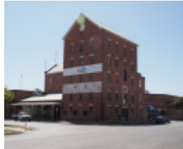
H1072 ECHUCA FLOUR MILL LHA 2015 1.JPG