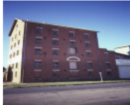
1 echuca flour mill side view of mill