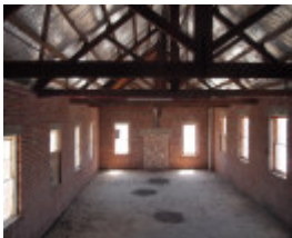
H1072 ECHUCA FLOUR MILL LHA 2015 5.JPG