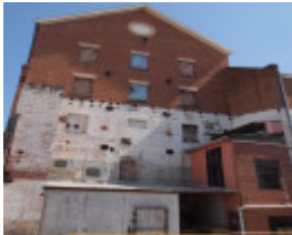
H1072 ECHUCA FLOUR MILL LHA 2015 2.JPG