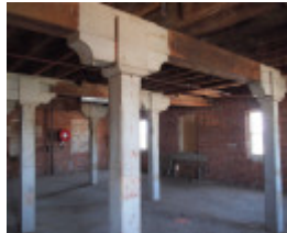
H1072 ECHUCA FLOUR MILL LHA 2015 4.JPG