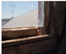
H1072 ECHUCA FLOUR MILL LHA 2015 7.JPG