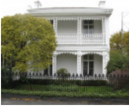
104 Gipps St_E Melb_KJ_11 June 09