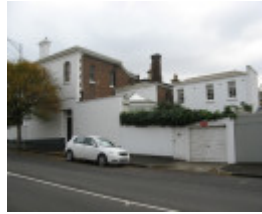
104 Gipps St_E Melb_rear_KJ_11 June 09