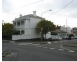
104 Gipps St_E Melb KJ_11 June 09