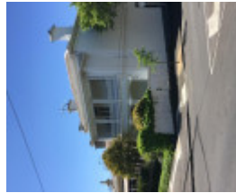
RESIDENCE October 2016