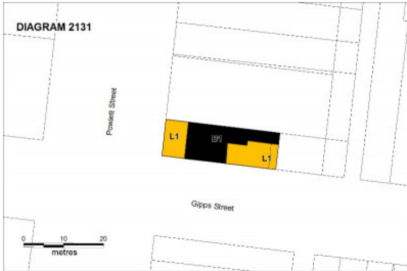
PROV H2131 104 gipps st plan