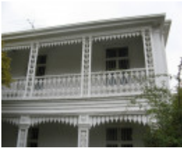
104 Gipps St_E Melb_verandah_KJ_11 June 09