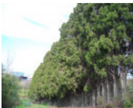
2976 Tay Creggan 30 Yarra Street Hawthorn Border Plantings 31