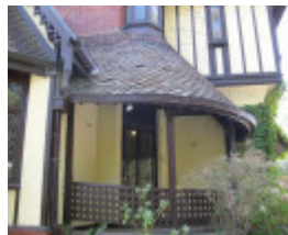
Tay Creggan_Hawthorn_KJ_Feb 09