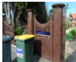
2976 Tay Creggan 30 Yarra Street Hawthorn Entrance 31