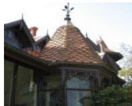
Tay Creggan_Hawthorn_turret_KJ_Feb 09