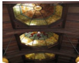
Tay Creggan_Hawthorn_domes in billiard room_KJ_Feb 09