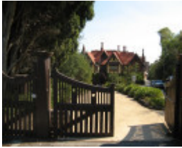
Tay Creggan_Hawthorn_front gates_KJ_Feb 09