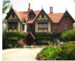
Tay Creggan_Hawthorn_KJ_Feb 09