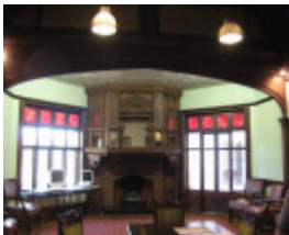
Tay Creggan_Hawthorn_billiard room_KJ_Feb 09