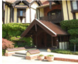
Tay Creggan_Hawthorn_front porch_KJ_Feb 09