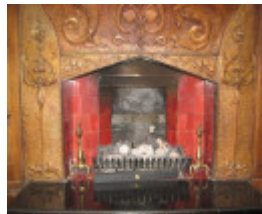
Tay Creggan_Hawthorn_billiard room fireplace_KJ_Feb 09