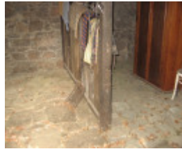
Correagh interior of stable