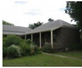
Correagh former kitchen wing