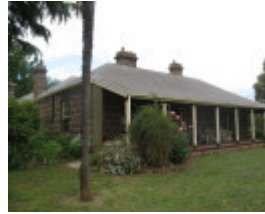
Correagh house from east