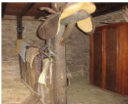
Correagh stable interior