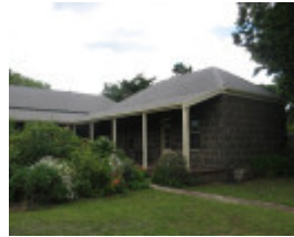
Correagh former kitchen wing