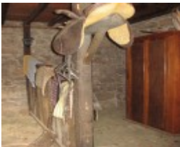
Correagh stable interior