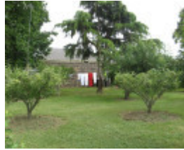
Correagh house from orchard (east)