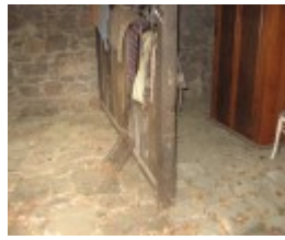
Correagh interior of stable