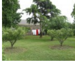
Correagh house from orchard (east)