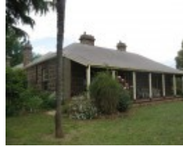
Correagh house from east