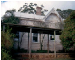
Braemar House Woodend Cottage