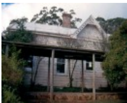
Braemar House Woodend Cottage