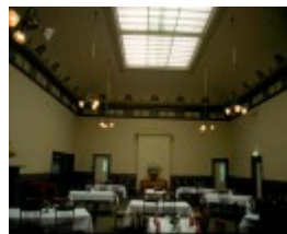
H02003 braemar house woodend dining