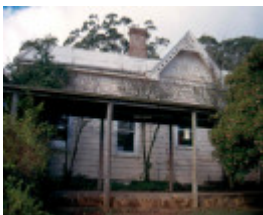
Braemar House Woodend Cottage