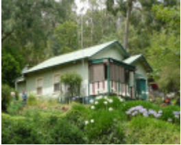
BRAEMAR HOUSE SOHE 2008