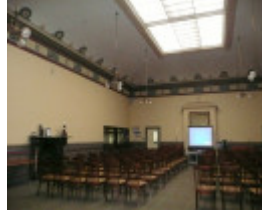
BRAEMAR HOUSE SOHE 2008