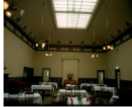
H02003 braemar house woodend dining