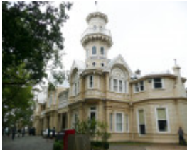
BRAEMAR HOUSE SOHE 2008