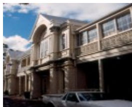
H02003 1braemar house woodend