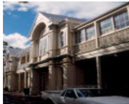
H02003 1braemar house woodend