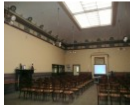
BRAEMAR HOUSE SOHE 2008