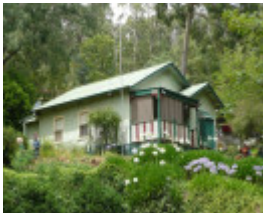
BRAEMAR HOUSE SOHE 2008