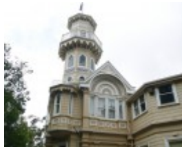
BRAEMAR HOUSE SOHE 2008