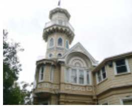
BRAEMAR HOUSE SOHE 2008