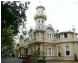
BRAEMAR HOUSE SOHE 2008