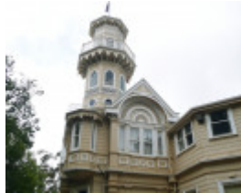
BRAEMAR HOUSE SOHE 2008