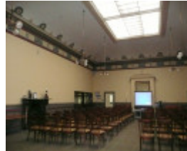
BRAEMAR HOUSE SOHE 2008