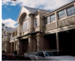
H02003 1braemar house woodend