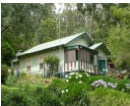
BRAEMAR HOUSE SOHE 2008