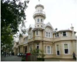
BRAEMAR HOUSE SOHE 2008