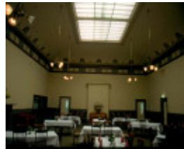
H02003 braemar house woodend dining