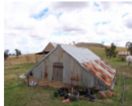
Underground water tank