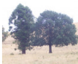
Algerian Oak and Bunya Bunya Pine