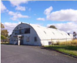
Former Army Radio Station