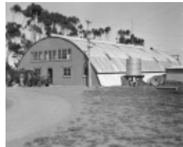
Diggers Rest, 1945. 'Exterior view of the new Igloo Building housing land headquarters signals.