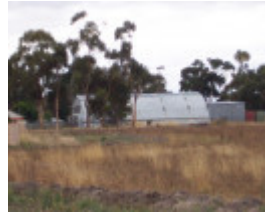
Former Radio Station