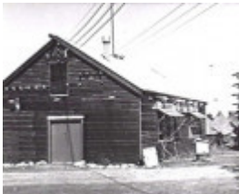
Diggers Rest, November 1945. The exterior of the old 'shack' at Diggers Rest, used by Land Headquarters Signals to house transmitters. This would have been one of the converted farm buildings.