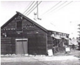
Diggers Rest, November 1945. The exterior of the old 'shack' at Diggers Rest, used by Land Headquarters Signals to house transmitters. This would have been one of the converted farm buildings.