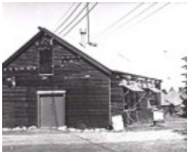
Diggers Rest, November 1945. The exterior of the old 'shack' at Diggers Rest, used by Land Headquarters Signals to house transmitters. This would have been one of the converted farm buildings.