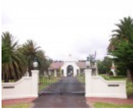
Former Wireless Beam Station