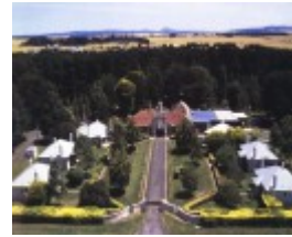
Rockbank Beam Wireless Station