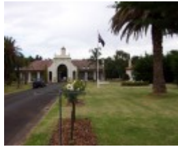
Former Wireless Beam Station