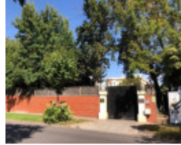
75-77 Irving Road, Toorak