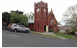
St Paul's Church of England