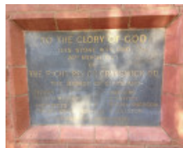
St Paul's Church of England