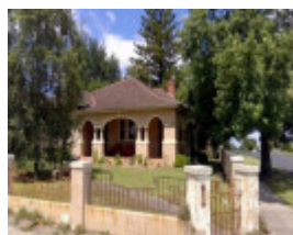
Former UV Knight's House, 26 Ogilvy St