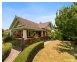
House, 45-47 Roughead St