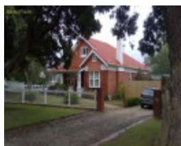
Mortlake, 41 Jeffrey St