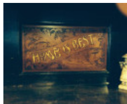
Dorfstedt interior - living room fireplace motto 2 (2015)