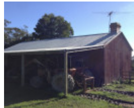
Dorfstedt stables and workers cabin (2015)