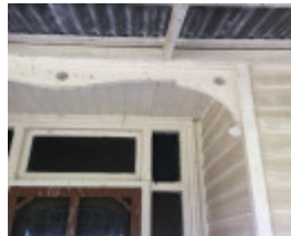
Dorfstedt entry detail (2015)