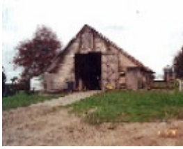
Dorfstedt barn (2000)