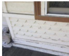
Dorfstedt bay window notched detail (2015)