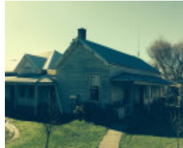
Dorfstedt kitchen wing (2015)