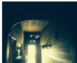
Dorfstedt interior - hallway (2015)