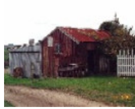
Dorfstedt outbuilding (2000)