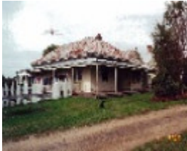
Dorfstedt homestead (2000)