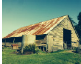
Dorfstedt Barn (2015)