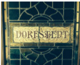
Dorfstedt front door leadlight name (2015)