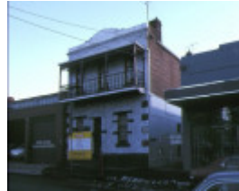
1 belmont johnston street collingwood front view