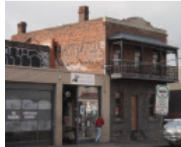
H0871 BELMONT LHA 2015 1.JPG