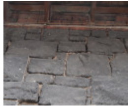
H0871 BELMONT LHA 2015 4.JPG