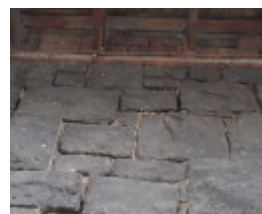
H0871 BELMONT LHA 2015 4.JPG