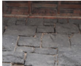
H0871 BELMONT LHA 2015 4.JPG