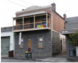
BELMONT SOHE 2008