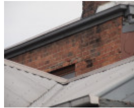
H0871 BELMONT LHA 2015 3.JPG