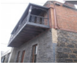
H0871 BELMONT LHA 2015 2.JPG