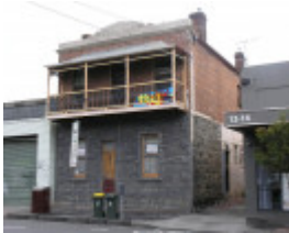
BELMONT SOHE 2008