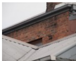
H0871 BELMONT LHA 2015 3.JPG