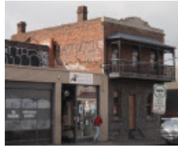
H0871 BELMONT LHA 2015 1.JPG