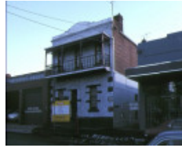
1 Belmont Johnston Street Collingwood front view