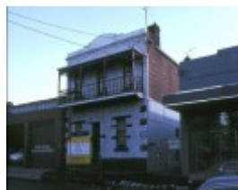
1 belmont johnston street collingwood front view