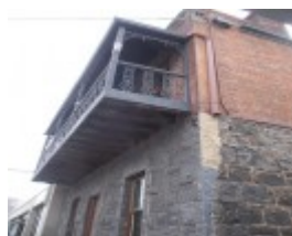
H0871 BELMONT LHA 2015 2.JPG