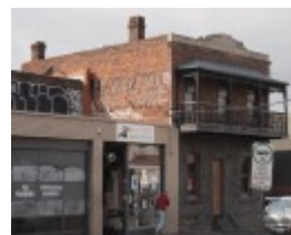
H0871 BELMONT LHA 2015 1.JPG