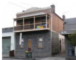
BELMONT SOHE 2008